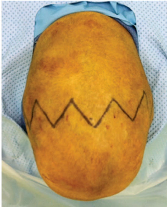
Fig. 1. Preoperative findings. Cephalic view photograph displaying severe scaphocephaly.