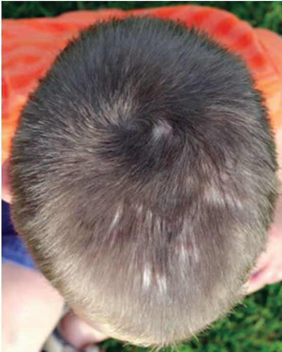
Fig. 4. One-year follow-up cephalic view photograph displaying excellent correction of the scaphocephaly.

posteriorly. The activation was done for a total of 17 days, with an endpoint of satisfactory cranial vault contour on physical examination. After 10 weeks of consolidation, clinical ossification at the level of the distracted areas was obtained and the distractors were removed (Fig. 3). Concomitantly, with the removal of the distractors, a contouring cranioplasty was performed to smooth the prominent step-offs generated by the distraction process.