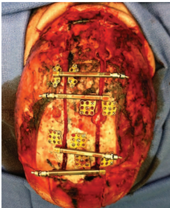
Fig. 2. Distraction osteogenesis technique. Placement of distractors.

To avoid the morbidities associated with open vault reconstruction, surgical correction using internal distraction osteogenesis has been explored. The majority of previous studies evaluated the effectiveness of distraction osteogenesis in the setting of multiple suture synostosis. 11-17 Limited information