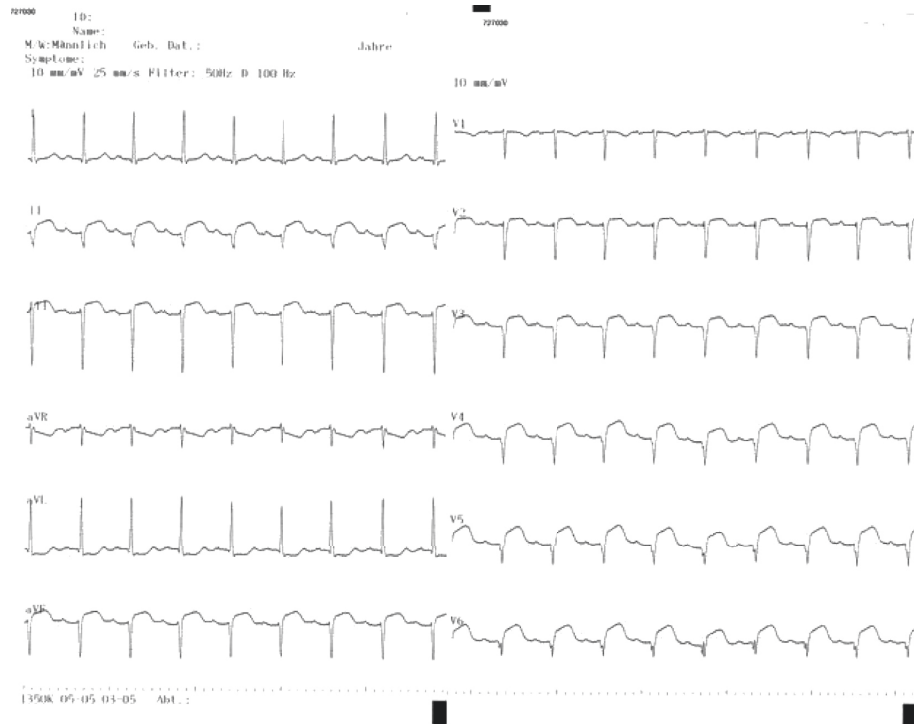
FIGURE 1: 12-lead electrocardiogram (ECG) on admission showing an ST-segment elevation in II, III, aVF, and V3–V6.

(PAE) (Figure 2). A rescue thrombolytic therapy with 100 mg recombinant tissue plasminogen activator (rt-PA) was administered intravenously. 12 hours later, respiratory stability was achieved and the patient remained hemodynamically stable without catecholamine. Nevertheless, ST-segment elevation persisted and hs-cTnI was still above the normal range with 40.580 pg/ml. A repeated bedside echocardiography revealed improvement of the right ventricular strain and left ventricular systolic function remained intact. However, 30 hours later, electromechanical disassociation suddenly occurred, and the patient died.