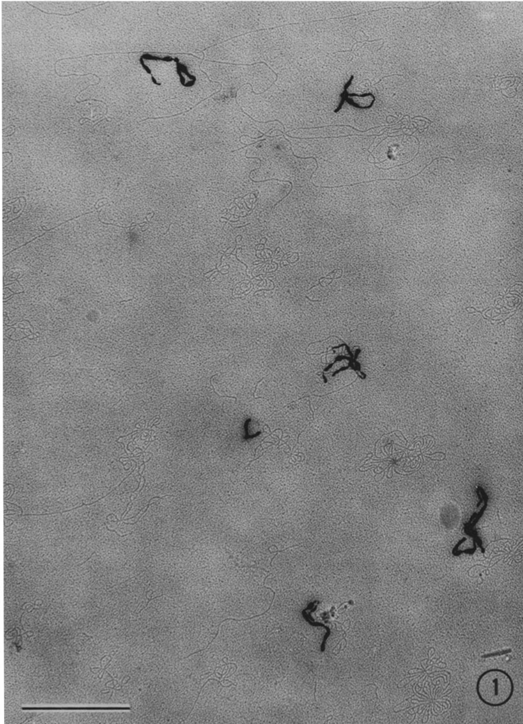
FIGURE 1 Tritium-labeled L-cell DNA prepared according to Kleinschmidt and Zahn (9) and Westmoreland et al. (13) and covered with Ilford L4 emulsion (10). Specific activity: 2.3 \times 10^5 cpm/ \mu g. Exposure time: 6 wk. Bar, 1 \mu m. \times 28,500 .