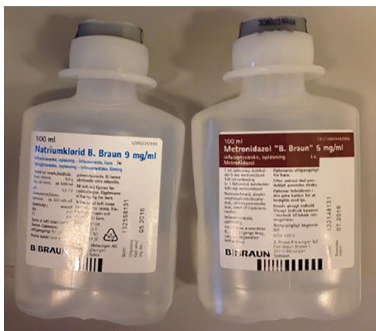
Figure 2. Drug confusion (look-alikes) between saline and metronidazole provided by the same pharmaceutical company.