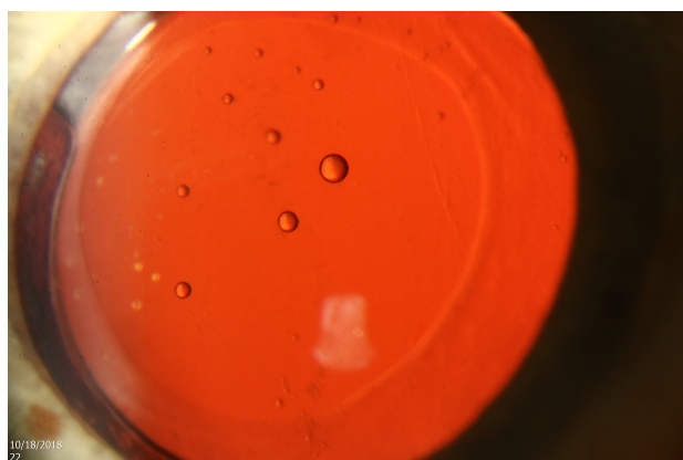
Figure 3 Silicone oil droplets post intravitreal injection of bevacizumab: 78-year-old female with exudative age-related macular degeneration of the right eye who had been receiving intravitreal injections of Avastin (bevacizumab) every 1–2 months for 4 years and 3 months demonstrating silicone oil droplets. Visual acuity was 20/60 on the initiation of anti-VEGF therapy and 20/25 at last follow-up on the acquisition of the photograph.

In addition to intraocular air bubbles, recent reports have shown presumed silicone oil drops associated with intravitreal anti-VEGF injections. Specifically, a recent study demonstrated 1.73% of patients receiving bevacizumab prepared with insulin syringes to have a complication of silicone oil droplets (Figure 3). 29 The culprit for these silicone oil droplets