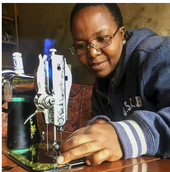
Refractive errors are responsible for most of the need for eye care services at primary level.