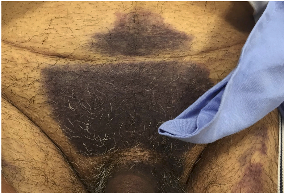
Fig. 1a. Suprapubic ecchymosis.