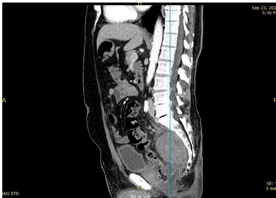
Fig. 2B. Sagittal view showing the hematoma in relation to S3.

put those vessels at risk of injury. It is unlikely to cause significant bleeding or hemorrhage in patients not on anticoagulants. There is a possibility that the anticoagulation therapy contributed to the development of this hematoma.