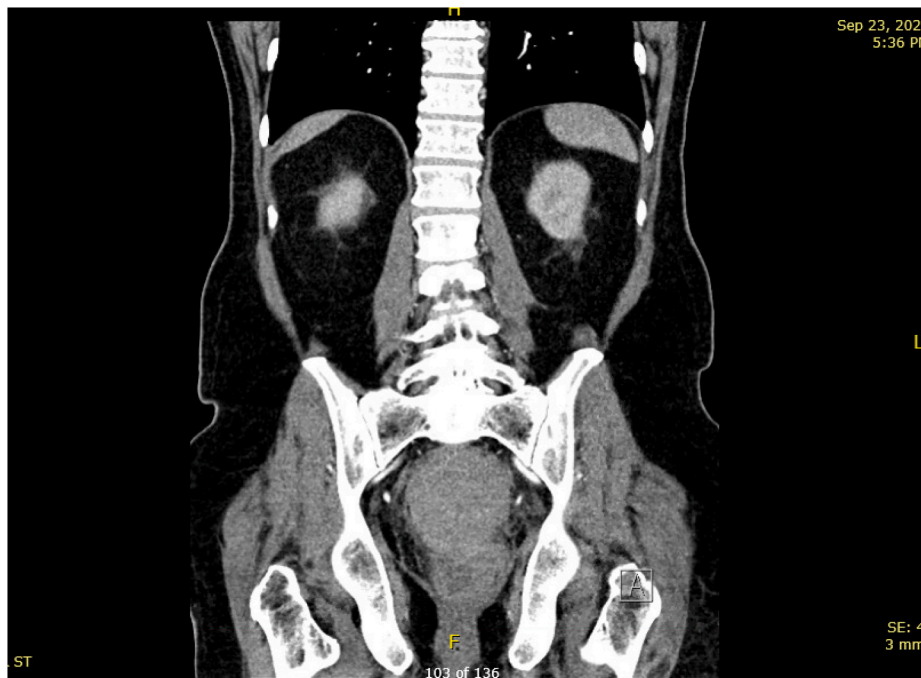
Fig. 2C. Coronal view shows no evidence of extravasation.

anticoagulation therapy. PNE is a low-risk procedure, but holding anticoagulants before PNE may be considered for patients at a high risk of bleeding. Retroperitoneal hematoma can be managed conservatively in hemodynamically stable patients. Appropriate resuscitation and angioembolization are the first-line treatments for patients who are hemodynamically unstable.