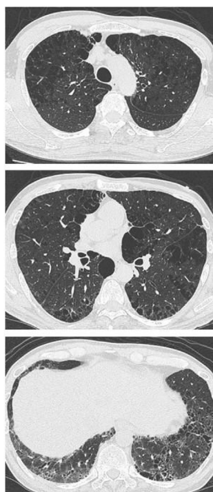
Fig. 1. Imaging findings at the initial examination. Chest radiography showed hyperlucency in both lungs and bilateral coarse reticular shadows in the lower lung field. On high-resolution CT, both centrilobular and paraseptal emphysema were seen in the upper lung zones on both sides and bilateral subpleural reticular and ground-glass opacities surrounding the emphysematous cysts were found in the lower lobes.