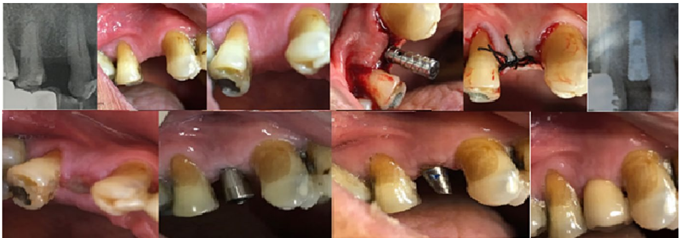
FIGURE 3 Clinical and radiographical procedure of dental implant placement

Four months after the implant insertion, the patient returned for punch removal of the gingiva overlying the implants. After 1 week, the appropriate impression copings were connected to the fixture. Polyether (Permadyne light and regular body; ESPE, Plymouth Meeting) was injected around the transfer copings and placed inside the custom tray using the dispenser. After laboratory procedure, abutment were positioned and torqued according to the manufacture's guidelines at 30 Ncm. After the surgical and prosthetic treatments were completed on February 2017, the patient was placed on a regular follow-up for peri-implant maintenance. The patient resumed IV BP therapy on May 2017. The oral hygiene regimen was implemented for this patient in a 6-month recall. The last follow-up (12 months after prosthetic delivery) showed minimum bone loss, as compared with the X-rays taken immediately after the prosthetic delivery and the implant, and its restoration was successful. The patient was satisfied with the treatment (Figure 4).