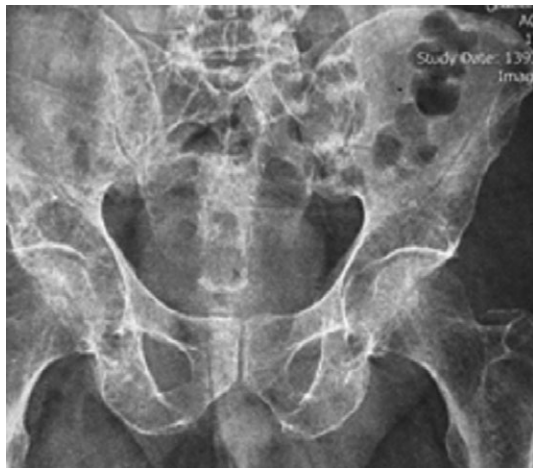
FIGURE 1 Lytic lesions in patient's hip radiography

occur in MM, jaw lesions are more common manifestations of this disease (with a prevalence of 8%-15%). Maxillofacial manifestations of MM into bony lytic lesions are not uncommon, and jaw involvement is seen in almost 30% of the cases which may affect both the maxilla and the mandible. 7