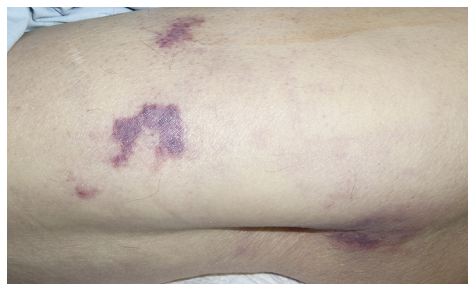
Fig 1. Retiform purpura of the left thigh with background livedo reticularis.