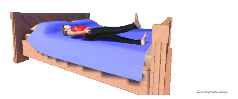
Figure 2. Screenshot of the Android tablet application during the straight leg raise exercise.

These methods allow for segmentation and classification of sensor data using support vector machine and random forest techniques described in further detail elsewhere [11,14]. The application