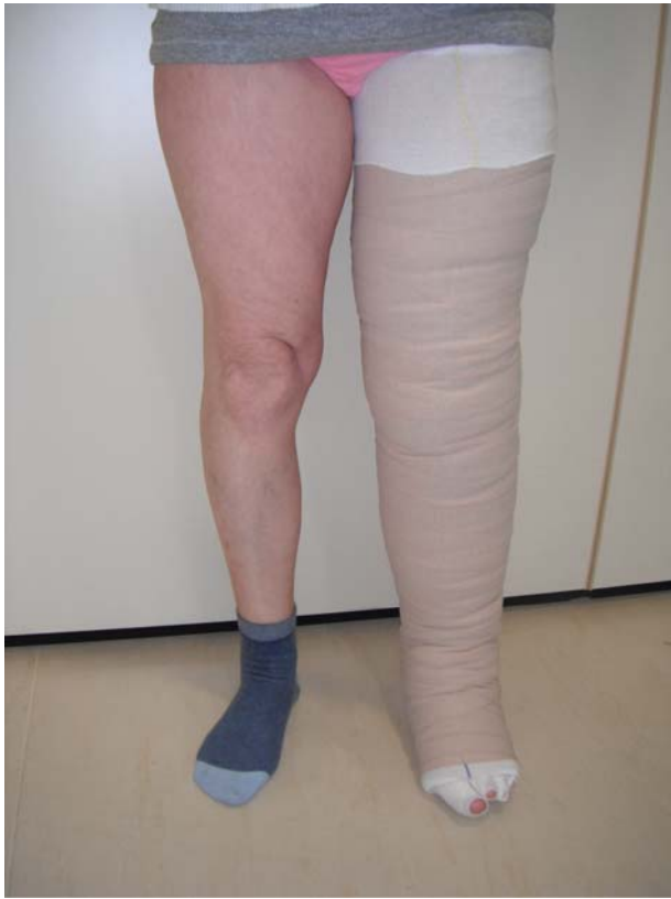
Fig. 1. Swollen left leg when the patient first presented.