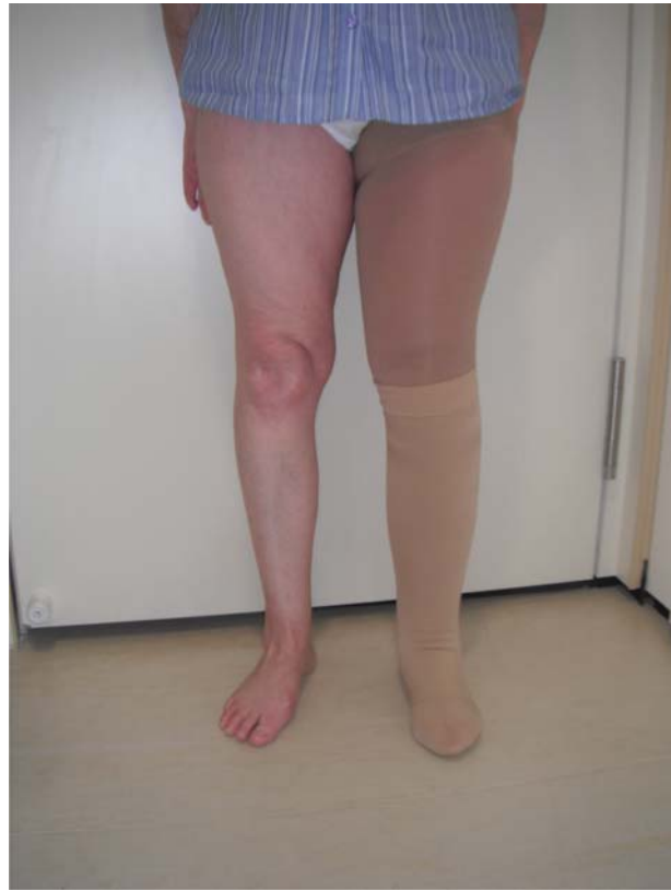
Fig. 3. Resolution of left swelling following withdrawal of sirolimus.