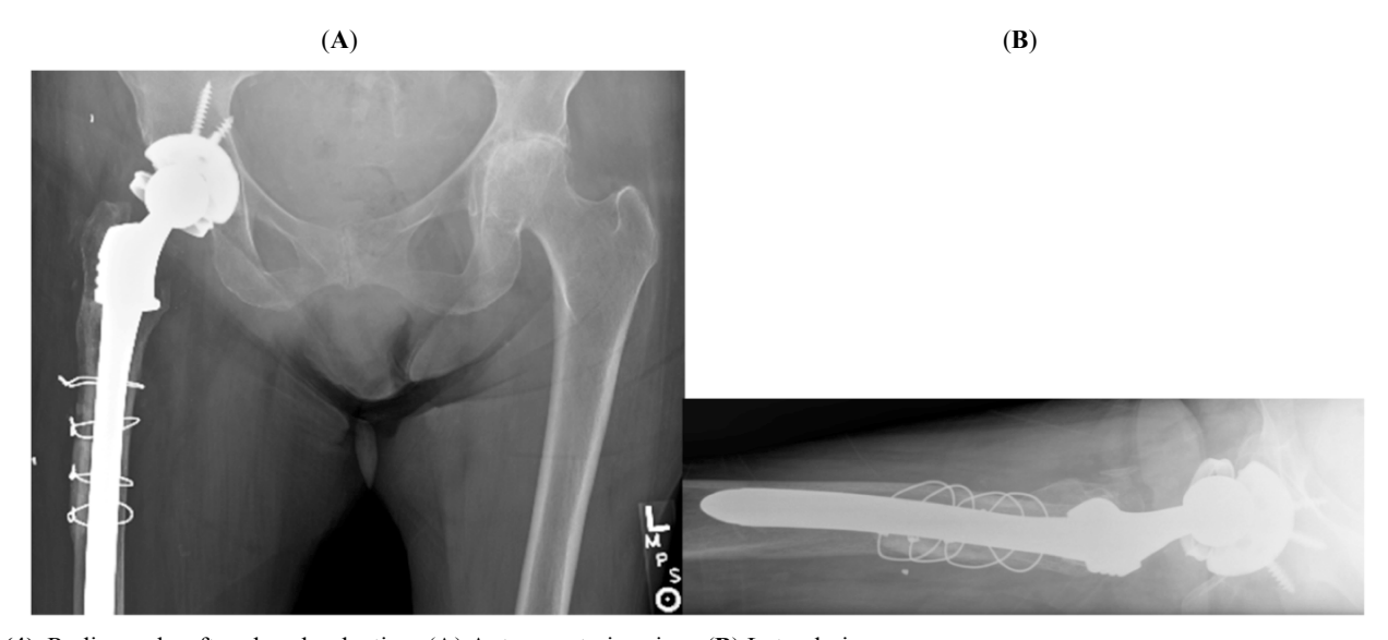
Fig. (4). Radiographs after closed reduction. (A) Anteroposterior view, (B) Lateral view.