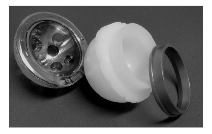
Fig. (1). The photograph shows the Trilogy constrained liner with a 10-degree oblique face (Zimmer, Inc, Warsaw, Indiana, USA).

A 79-year-old female underwent primary THA for nonunion of a right subtrochanteric fracture of the femur with degenerative arthritis of the right hip joint using an uncemented Trilogy acetabular system and fully porouscoated stem (Zimmer, Warsaw, Indiana, USA). Five years later, at age 84, the hip was revised to a Trilogy constrained liner with a 10-degree oblique face and 32-mm head (Zimmer, Inc, Warsaw, Indiana, USA) (Fig. 1) for instability and recurrent dislocation (Fig. 2). However, 5 years after the revision surgery, at age 88, she bent over, hyperflexed the hip and complained of right hip pain. A radiograph in the emergency department in our hospital demonstrated dislocation of the constrained THA. The head appeared to have dislocated from the liner, and the locking ring disengaged but was not broken (Fig. 3). A closed reduction was performed in the emergency department with sedation. The head was relocated and the locking ring was