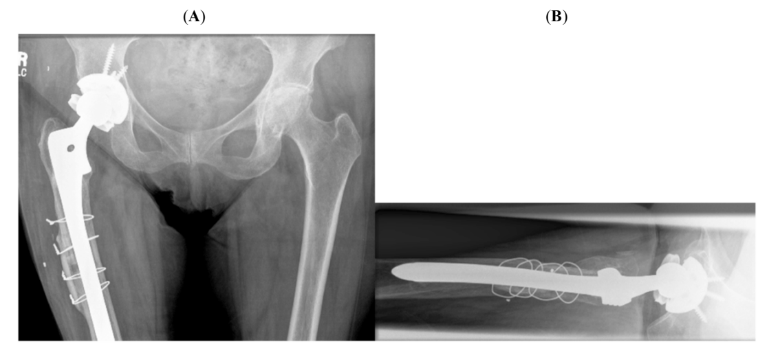
Fig. (2). Radiographs before dislocation. (A) Anteroposterior view, (B) Lateral view.

repositioned to where it was previously located (Fig. 4). The patient's hip was placed in an abduction brace with full weight bearing. Further radiographs demonstrated no further change. The patient could ambulate with minimal aid. The patient died 10 months later of unrelated causes.