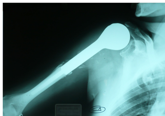
Figure 2 Right humerus nail replacement.

three times per week, recombinant human interleukin-2 at a dose of 9 \times 10^6 IU subcutaneously for 4 weeks followed by 1 week of rest, and vinorelbine 30mg/m 2 and zoledronic acid 4mg every 21 days. Then he underwent a right humerus nail replacement with 10-fraction radiotherapy in order to render his extremity pain-free and capable of weight-bearing (Figure 2). He was offered physiotherapy but declined. He received IFN- \alpha treatment for a further 4 months and, notably, resumed playing the bouzouki, which requires significant upper-extremity dexterity, attesting to a dramatic improvement of his symptoms. His disease was stable and he led an active life from September 2003 to June 2008, when a chest CT scan revealed several enlarged subcarinal, left hilar, and axillary lymph nodes. He was treated with sunitinib at 50mg/day for 4 weeks with a 2-week wash-out phase along with vinorelbine 30mg/m 2 , bevacizumab 200mg, and zoledronic acid every 21 days. A partial response was observed until February 2009, when a chest CT scan revealed several pulmonary nodes consistent