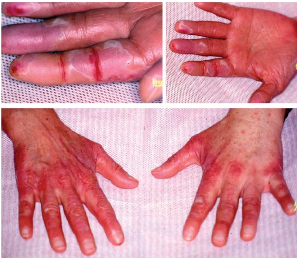
Figure 2 Photographs of grade 4 palmo-plantar erythrodysesthesia.