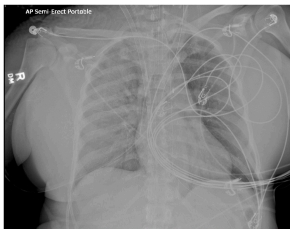
Image 1. Chest radiograph Day 2: Diffuse bilateral infiltrates and pulmonary edema.

complications characterized by venous embolism of silicone leading to pneumonitis, diffuse alveolar hemorrhage, and silicone embolism with severe cardiopulmonary failure.