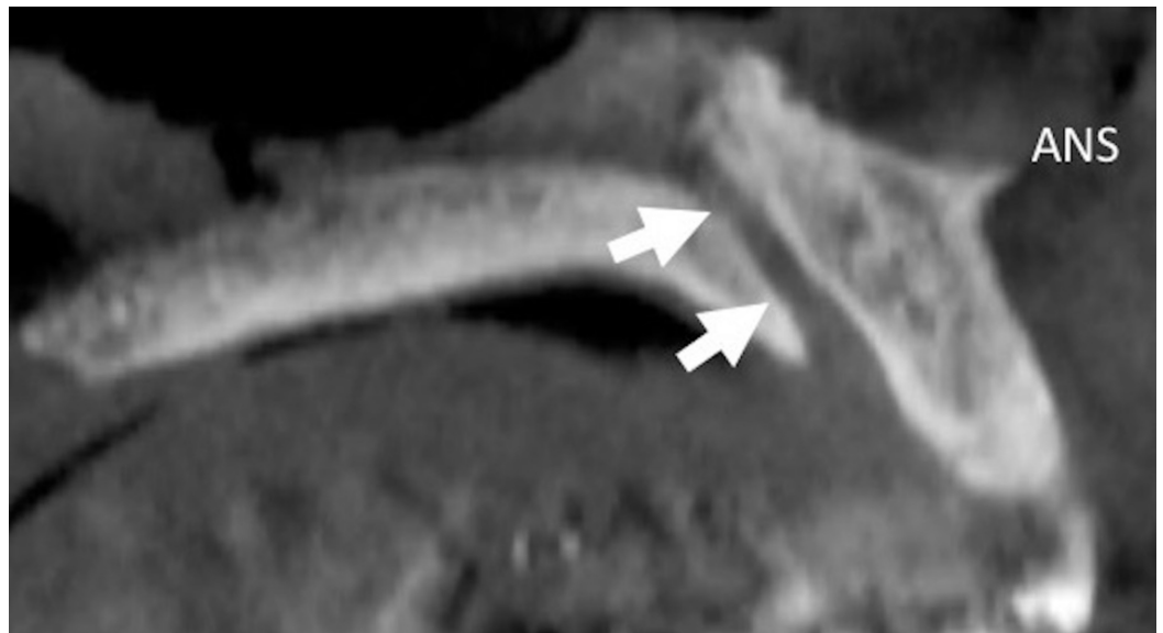
FIGURE 2: Midsagittal plane of the incisive canal (arrows) on CBCT image.

canal giving better high-resolution images, eliminating image superimposition, offering less radiation exposure, and providing better analysis of bone quality (Figures 2, 3) [1,2,17].