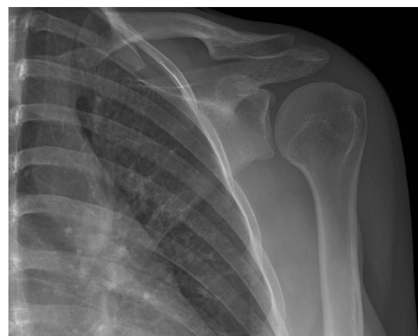
Figure 3 AP radiograph of the nondisplaced pathologic coracoid process fracture.

We recommended non-operative management of this stable injury. Short-term immobilization using a sling followed by initiation of physiotherapy was arranged. Gentle strengthening was to start after approximately four to six weeks as tolerated.