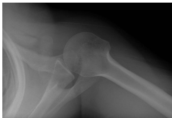
Figure 4 Axillary radiograph showing the pathologic coracoid fracture.

Tragically, this previously healthy, active, young woman was admitted to an outside facility only two weeks later with hypercalcemia, multiple sites of bone metastases noted on skeletal survey, and an abnormal liver scan. She was diagnosed with metastatic adenocarcinoma of the left breast. In addition to the coracoid, she had multiple metastatic lesions in her thoracic spine and bilateral femurs as well as brain and liver metastases. Over the course of the following four months she suffered from encephalopathy, SIADH, leptomeningeal carcinomatosis, and eventually passed away in her home receiving palliative care.