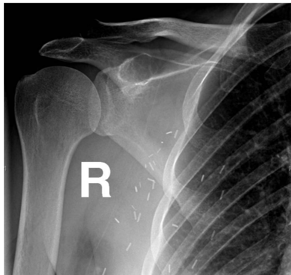
Figure 1 AP radiograph demonstrating the metastatic lesion of the coracoid process.

biopsy specimens from the lesion at the base of the coracoid were sent to pathology for frozen section and permanent sections. The intra-operative frozen section was positive for adenocarcinoma.