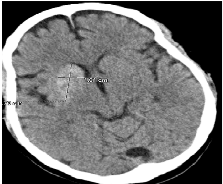
FIGURE 1: CT head showing hyperdensity (probable hemorrhage) in the right caudate nucleus head and anterior putamen