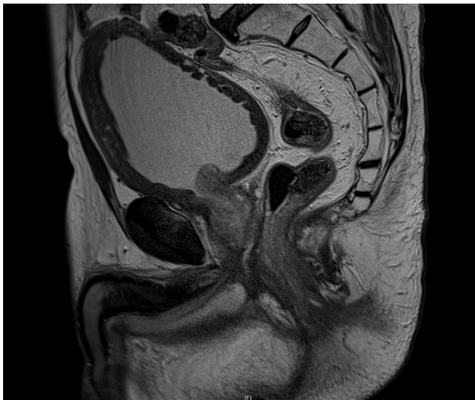
FIGURE 1: MRI Rectum

Sagittal T2 section of an MRI rectum post-chemoradiation and prior to the APR. It demonstrates multiple small diverticula in the bladder wall and features of trabeculation.