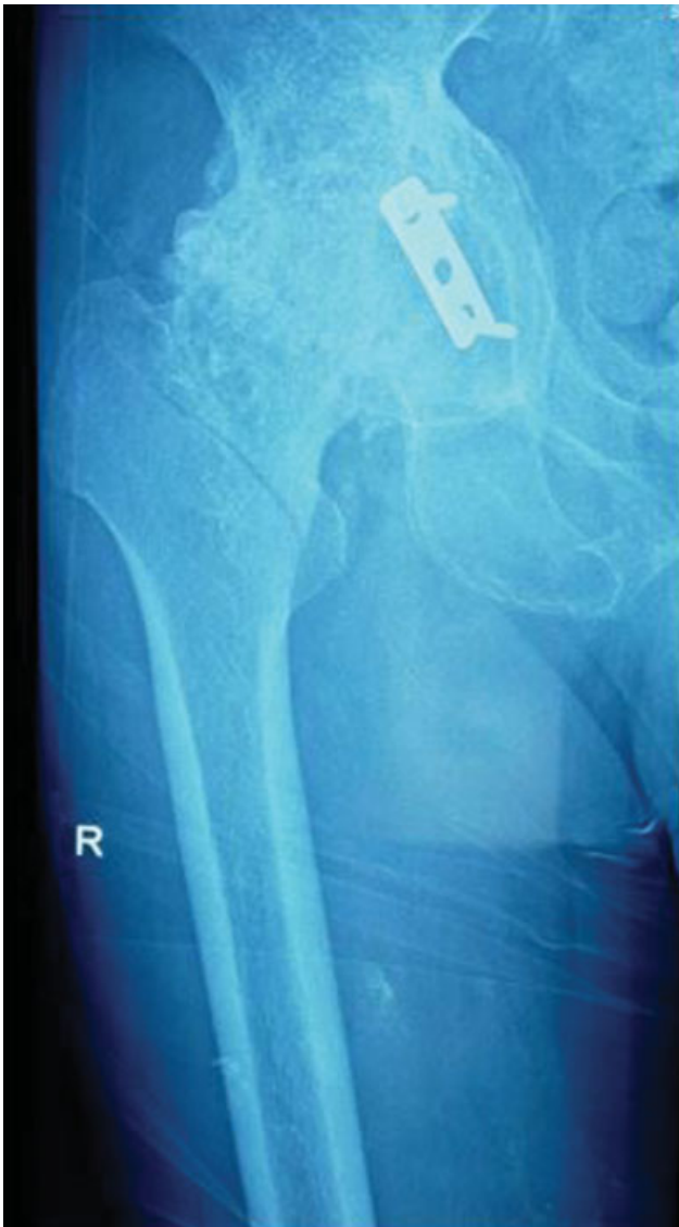
Fig. 1 Non-displaced fracture of the intertrochanteric region of the femur in an ankylosed hip.

Intertrochanteric fractures of the femur in ankylosed hips are extremely rare, and there are only a few cases reported in the literature. The non-operative management is associated