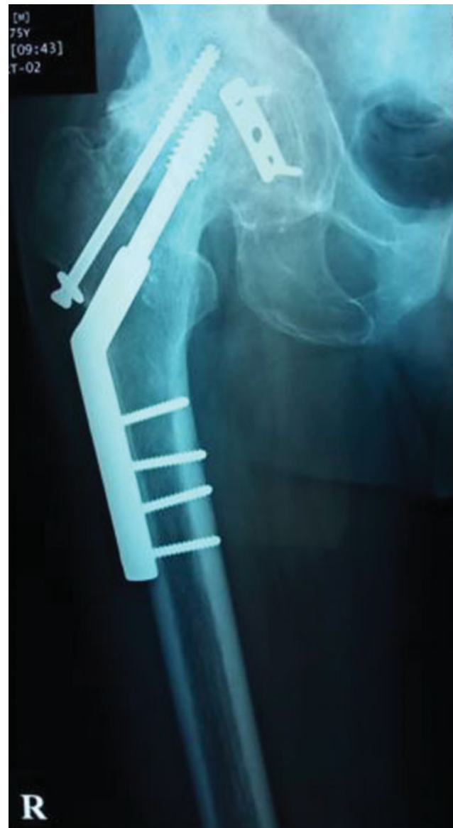
Fig. 2 After one and a half year of the operation: the fracture is united, and the implants are in situ.