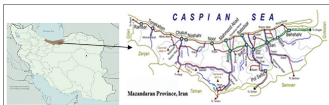
Figure 1: The regions position of Mazandaran Province map, Iran

HPLC technique is the most widely used quantitative screening method for different and particular chemical materials, especially diagnosing inborn metabolism disorders, chosen for its speed and specificity, and because it permits simultaneous quantification of several biochemical markers using small sample volumes. This method, using assessment phenylalanine level and phenylalanine/tyrosine ratio, reduces false-positive results. [7,8,24]