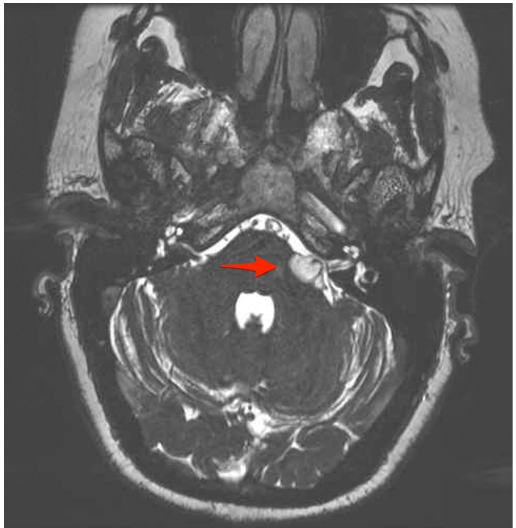
FIGURE 1: Axial fast imaging employing steady-state acquisition (FIESTA) sequence magnetic resonance imaging (MRI)

Image demonstrates a 17-mm hyperintense mass in the left cerebellopontine angle (CPA) with moderate mass effect on brainstem and surrounding structures. Arrow highlights involvement of cranial nerves VII and VIII.