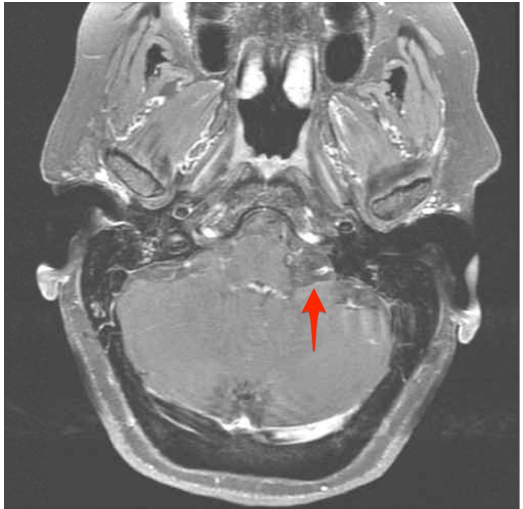
FIGURE 3: Axial T1 post-contrast fat saturation sequence magnetic resonance imaging (MRI)

Image demonstrates loss of signal hyperintensity within the left cerebellopontine angle mass with fat saturation techniques (see arrow), as is typical of fatty lesions.