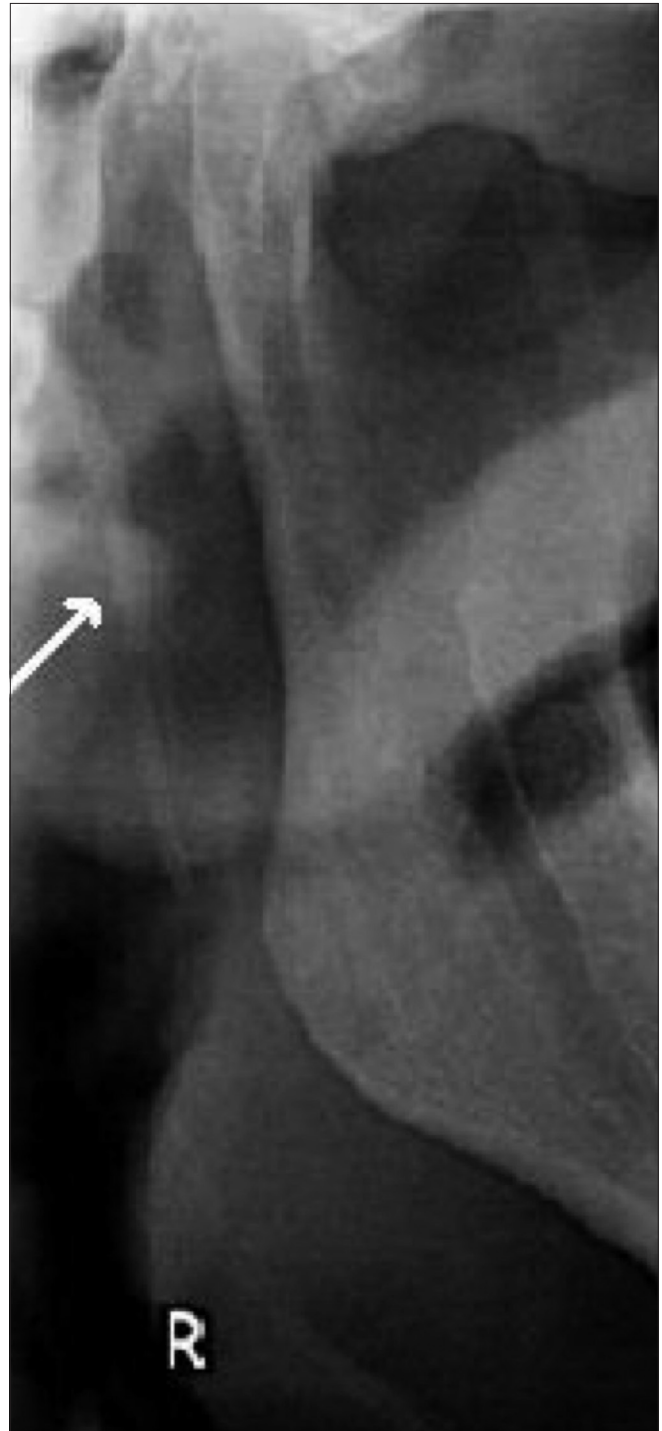
Figure 3: The orthopantomogram shows a partially calcified styloid process (arrow)