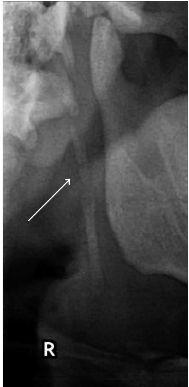
Figure 5: The orthopantomogram shows a Langleis type III styloid process (arrow)

Among the several imaging modalities used for diagnosis of the Eagle syndrome, panoramic radiography, lateral skull radiograph, Towne's view radiograph, anteroposterior skull radiograph, and CT scan are some of them. The complete details of the length, angulation, and relation to adjacent structures can be obtained from a CT scan by formulating a 3D-CT. [10,11]