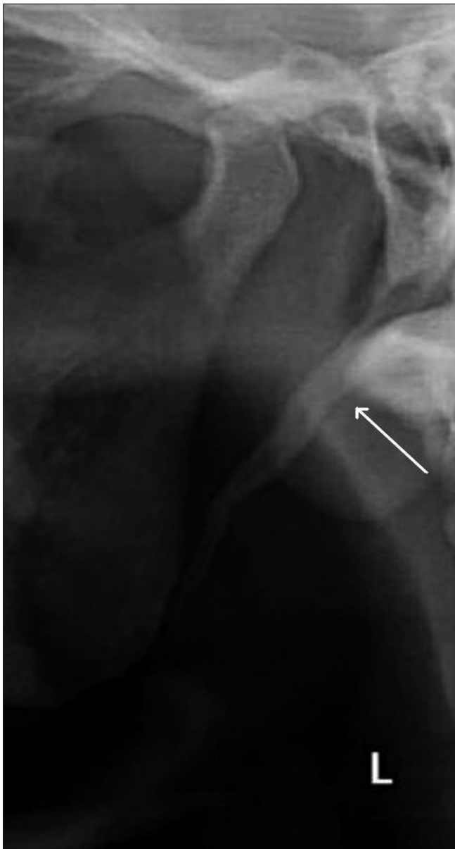
Figure 2: The orthopantomogram shows a Langlais type I styloid process (arrow)

Langlais (1986) [9] has classified elongated styloid processes according to the type of elongation [Figure 1].