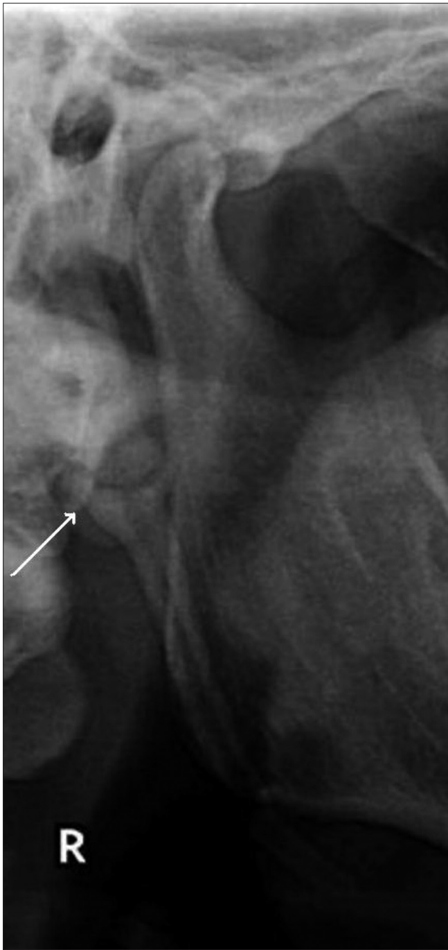
Figure 4: The orthopantomogram shows a Langleis type II styloid process (arrow)