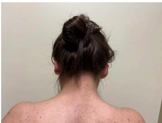
Figure 2 Phenotypical characteristics suggestive of TS with large and low-implantation earlobes, short neck and hypertelorism. TS, Turner syndrome.

She is currently 27 years old and has reached a height of 135 cm (significantly below her target family height of 165 cm) but has a normal BMI (21.9 kg/m 2 ). During the follow-up, she presented two HbA1c values of 5.8%; however, a return to normoglycemia was achieved through lifestyle measures. Heterogeneous echogenicity of the thyroid gland and positive anti-peroxidase antibodies were detected, making the diagnosis of autoimmune thyroiditis. The patient has been kept under multidisciplinary follow-up and no further endocrine abnormalities have been found so far.