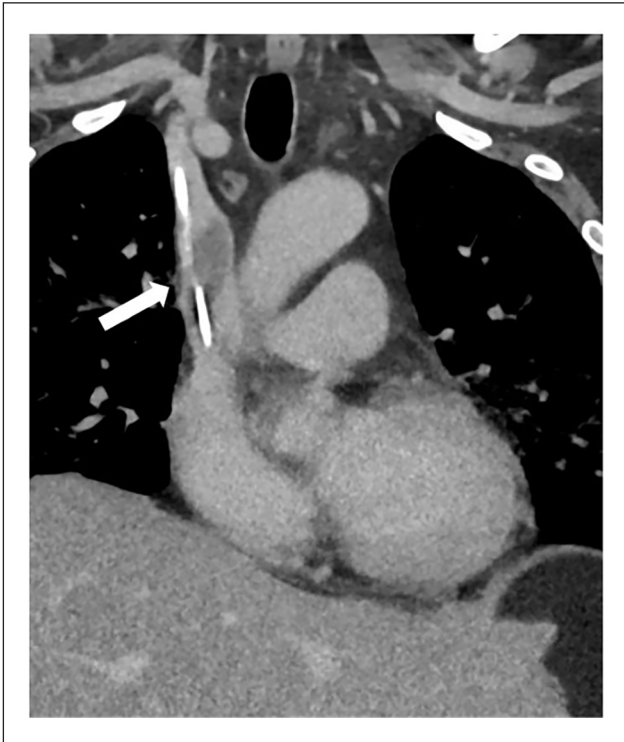
Figure 1. Computed tomography showing a central venous catheter in the superior vena cava with associated thrombus (arrow).

as well as anticoagulation were initiated. After the surgical removal of the port-a-cath, the initial intravenous heparin therapy was switched to enoxaparin. Despite surgical debridement of the septic coxitis, bacteremia and sepsis persisted. Moreover, follow-up CT scan showed considerable clot progression adherent to the wall of the in the SVC (Figure 1). Based on this finding, septic thrombosis was suspected as focus of persistent bacteremia and the decision for an endovascular thrombectomy was made. To limit risk of a septic clot embolization during the procedure, a peri-interventional cava filter was used. A right transjugular venous access using a 10 French Avanti® sheath (Cordis, Hialeah, FL, USA) and a transfemoral access using a 60 cm 10 French sheath from the Capturex® filter were established. A transjugular phlebography was performed identifying the clot in the SVC (Figure 2(b)). Transfemorally, the peri-interventional filter was positioned in the SVC (Figure 2(a)), which was later slightly retracted to avoid interference between the filter and the RAT fragmentation basket. Via transjugular access, a mechanical shaving of a wall-adherent, organized thrombus was achieved using a RAT fragmentation basket® (Bard, Covington, GA, USA) (Figure 2(c)), which showed incomplete therapeutic success. Finally, via transjugular access a 10 French rotational mechanical thrombectomy device Aspirex® (Straub Medical AG, Wangs, SG, Switzerland) was used. After