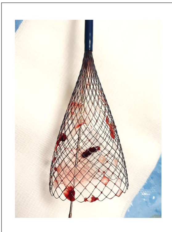
Figure 3. After retrieving of the peri-interventional cava filter Capturex® clots caught in the filter were visualized.