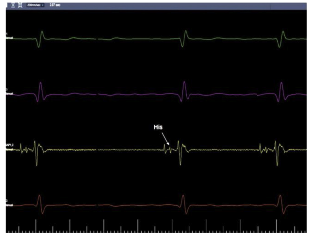
Figure 2 Intracardiac signals of His potential obtained from the KODEX EPD system (EPD Solutions, Philips, Best, The Netherlands).

The KODEX-EPD cardiac imaging and navigation system is a novel catheter-based cardiac EP system. Acquiring the electromagnetic information through all conductors in touch with the patient's body, the system allows extremely accurate real-time localization and visualization of any intracardiac catheter, as well as acquisition and display of HD computed tomography-like cardiac images, either as a conservative reconstructed 3D image or as a flattened 3D panoramic view (PANO). Furthermore, the KODEX-EPD system can operate with any standard affordable sensorless EP catheter as well as pacing leads. Only a few hospitals have used this advanced system so far, and the cumulative clinical experience is limited to the field of therapeutic guided catheter