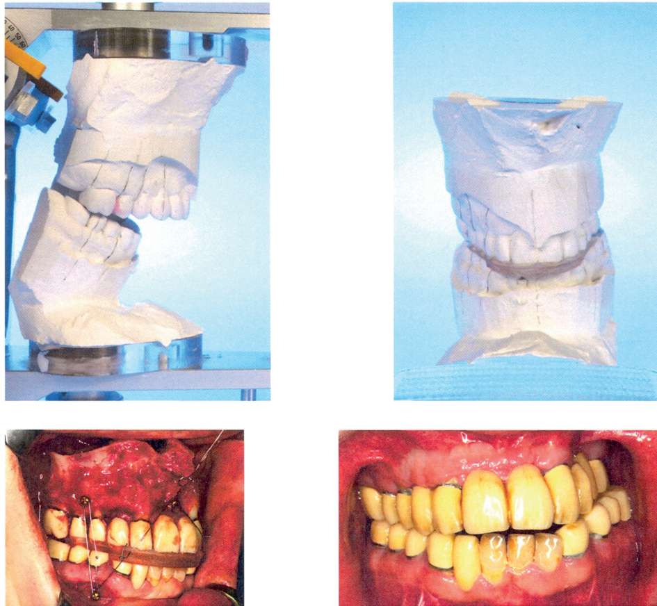
Figure 4. Upper row: The corresponding model situation for patient 2 before surgery (left) and after reorientation of the mandibulomaxillary complex. The desired occlusal relations are safeguarded by the virtually designed splint (right). Lower row: The corresponding situation during surgery. The occlusion of the mandibulomaxillary complex is safeguarded by the virtual splint (left). The final clinical situation (right) corresponds well to the virtually planned situation before surgery (Figure 3).