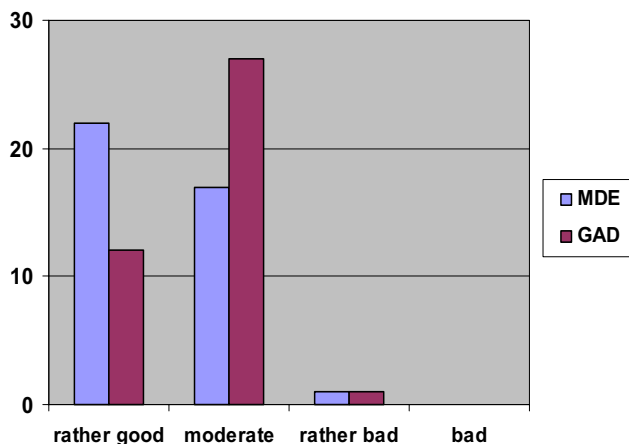
Figure 1 GPs' self-perceived ability to recognize common mental disorders (N = 40).

between Norwegian and German GPs is not significant ( p = 0.24 ). Norwegian GPs do not perceive their own ability as good as the German GPs concerning GAD ( p = 0.002 ), but still only one GP in the Norwegian sample considered his recognition ability 'rather bad' and no one considered it 'bad'. With this high confidence in their recognition abilities, we assume that most GPs' motivation for improvement of their abilities in relation to common mental disorders is only moderate at best.