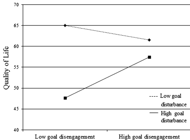
Fig. 2 Goal disengagement as a moderator of Quality of Life