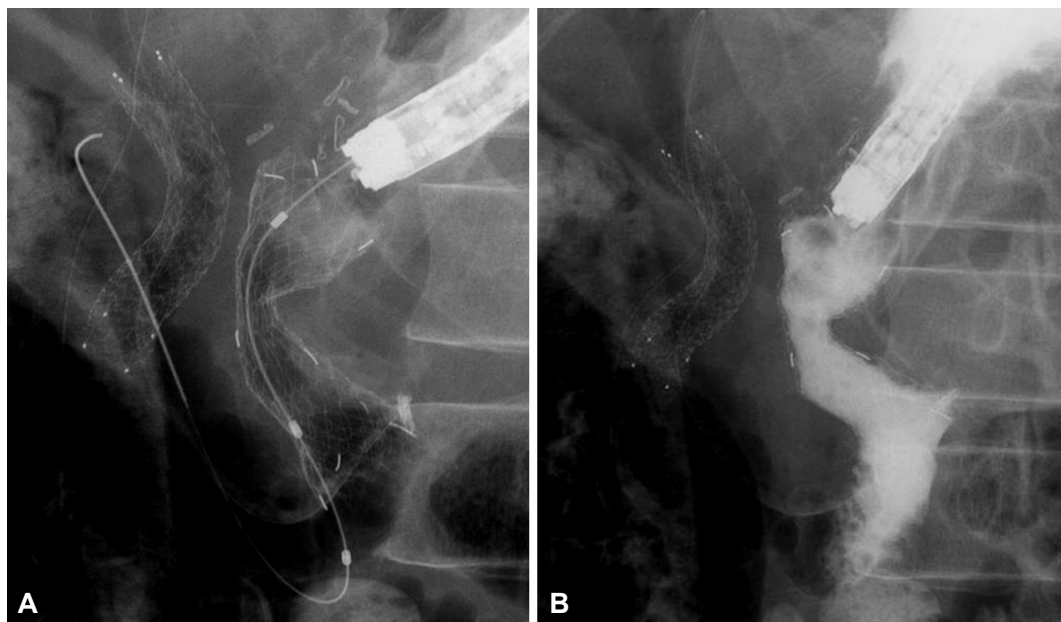
Fig. 2. (A) An enteral stent placed in the afferent loop stricture. (B) Contrast radiograph showing that contrast medium flows only into the afferent loop.