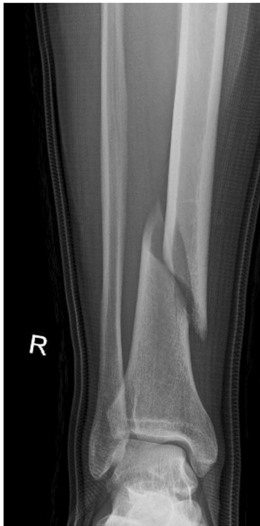
Fig. 1 Type A