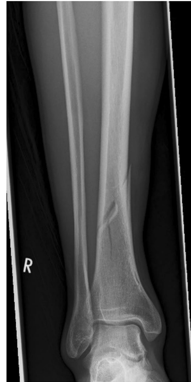
Fig. 2 Type B

For type A fractures (29 of 51), compared to type B fractures (1 of 14), there was a significant increase in the probability of an additional posterior malleolus fracture ( p=0.001 ). This relationship existed for spiral fractures regardless of the fracture location (middle third vs. distal third for spiral type tibia fractures: Chi-square test p=0.168 , Fisher’s exact test p=0.249 ).