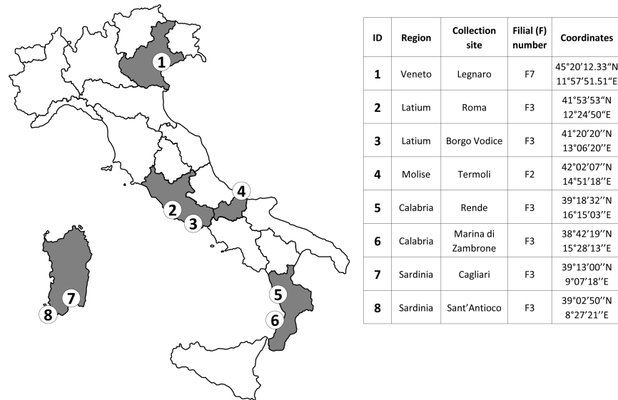
Fig 1. Description of Aedes albopictus populations. Locations and filial generations (F) of the Italian Ae. albopictus populations experimentally infected with CHIKV.

https://doi.org/10.1371/journal.pntd.0006435.g001