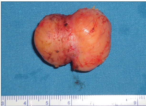
Fig. 2. The 3×2 cm sized, ovoid nodule that was excised. Unlike typical lipomas, the mass was quite firm and rubbery in texture.