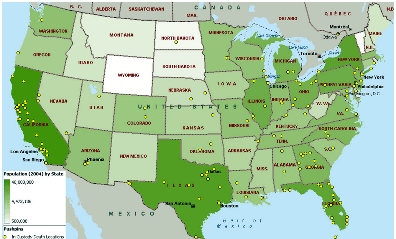
Figure 1. Map of ARD locations during the 12-month surveillance period. Note that many of the mapped points are overlapping, so some map points represent more than one event.

of ARDs primarily due to lack of reporting compliance and the inclusion of all types of death that occurred in custody. Our project primarily examines deaths other than homicide or suicide, namely sudden, unexpected death during custodial arrest from no readily apparent cause.