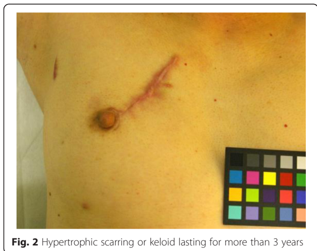
Fig. 2 Hypertrophic scarring or keloid lasting for more than 3 years

The biggest advantage of IORT from the patient's perspective is that adjuvant radiotherapy is performed during tumor resection, and therefore, recurring visits for radiotherapy are unnecessary. Other types of APBI, such as brachytherapy and three-dimensional conformal radiotherapy can also shorten the duration of radiotherapy, but they do not approach the timeframe of IORT. However, the biggest advantage of IORT from the medical perspective may be different from that of the patient. Patients who receive IORT with electrons and thoracic shield will not undergo unnecessary irradiation to the heart, lungs, and skin. This is very important, especially in the Asian population whose average breast size is