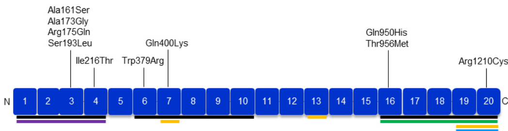
Figure 2. Schematic representation of factor H and its functional domains. Factor H is composed of 20 complement control protein (CCP) domains, and the approximate locations of missense variations are indicated at the top of the diagram. The location of the binding sites for C3b (black), cofactor activity (purple), heparin (orange), sialic acid (green), and self-surface recognition (blue bars) are mentioned below the diagram.

than the number of carriers in the general population (EVS; p=0.008 ). The carriers of rare CFH variants displayed an earlier age at onset than non-carriers ( p=0.016 ). This emphasizes the importance of a sequence analysis of the entire CFH coding region and the splice junction of the CFH gene to identify the causative allele, in particular in individuals with the CD subtype of AMD. The p.Arg1210Cys variant has previously been demonstrated to confer a high risk of developing AMD [10], underscoring its pathogenicity. However,