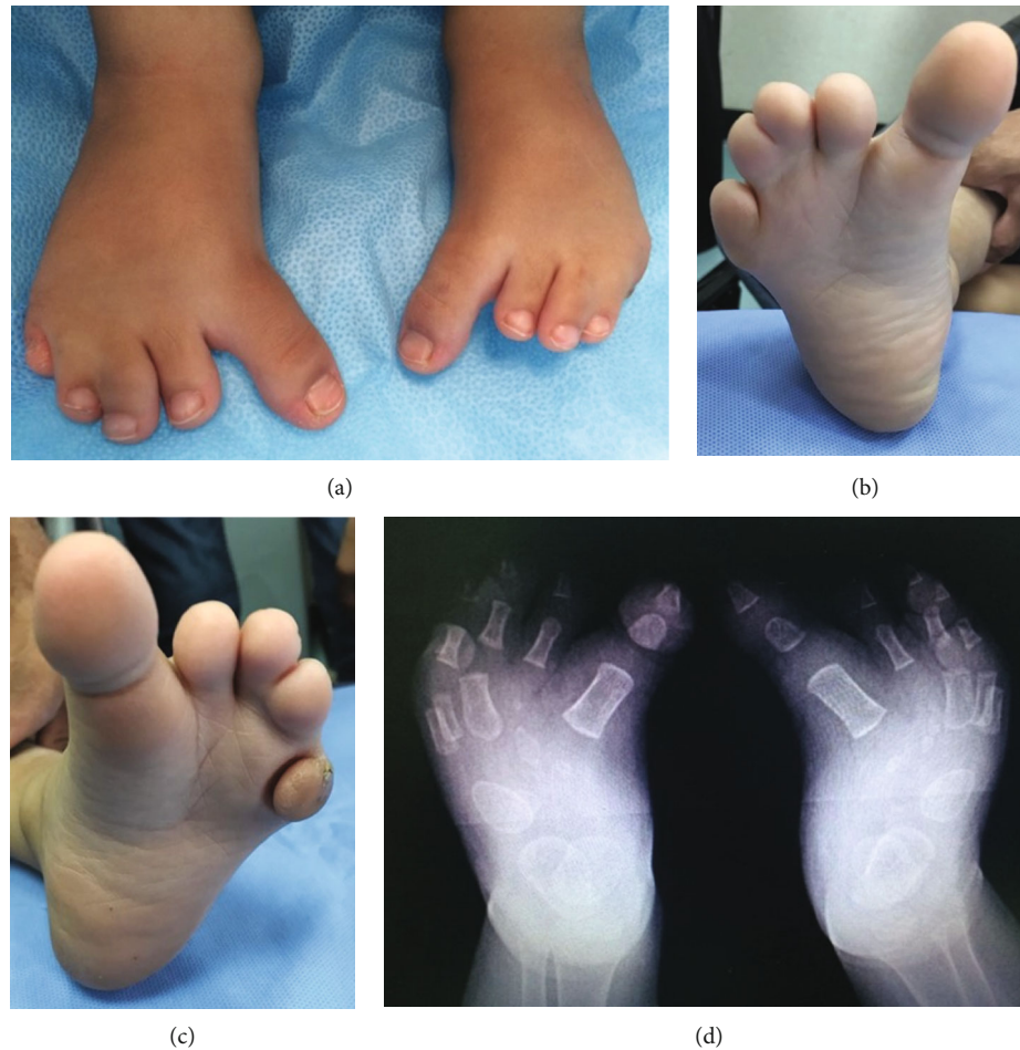
FIGURE 3: The feet of the homozygous child: (a) note the relatively long and medially deviated big toes. Also, note the plantar flexion deformity of the postaxial four toes; (b) cupping of the forefoot on the right; (c) cupping of the forefoot on the left; (d) X-rays of the feet. Note the metatarsal-to-tarsal transformation.

phenotype, and the parents presented the child to the author requesting surgical correction of his deformities. The pregnancy was uneventful. Anthropometric measurements revealed normal stature, weight, and head circumference. Systemic examination showed no abnormalities, and ultrasound of the abdomen was normal. All abnormalities were confirmed to the hands and feet. His phenotype is summarized in Table 3 and Figures 2 and 3. Relatively long and medially deviated big toes and cupping of forefeet (leading to plantar flexion deformities of the lateral four toes) were noted bilaterally (Figure 3).