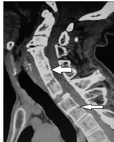
Figure 2: Multiple block vertebrae C4-D1, butterfly vertebrae D2-3, cervical scoliosis without cord compression

Type II is commonest; C2-3 and C5-6 inter-spaces are most often fused. [2] The triad of low posterior hairline, short neck, and restricted neck motion is present in only 50%.