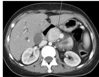
Figure 1: Prechemotherapy contrast-enhanced computed tomography scan showing, enhancing mass in the head of pancreas causing dilatation of the pancreatic duct, Common bile duct and the intra hepatic biliary tree

She was asymptomatic and her disease was under control until April 2011 when she developed nausea, vomiting and rapidly progressive jaundice. On investigating, the serum(S) bilirubin levels were 34 mg/dl with predominant direct-bilirubinemia, S transaminases (serum glutamic oxaloacetic transaminase/serum glutamic pyruvic transaminase) levels were 238/100 units/liter and S alkaline phosphatase was 1440 units/l. Contrast-enhanced computed tomography (CECT) scan demonstrated an irregular hypodense mass located at the head of the pancreas with dilatation of the common-bile-duct and intrahepatic-bile-ducts;