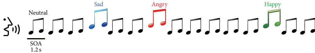
FIGURE 1: Illustration of the experimental design. In a passive oddball design, standard stimuli were applied, that is, a random disyllabic utterances from female speakers in a neutral voice. Twenty percent of the stimuli were deviant events, that is, either sad, happy, angry, or male utterances. SOA: stimulus onset asynchrony.

investigated the effect of aging on the neural response of automatic processing of prosody change detection using an oddball paradigm, that is, mismatch responses [12, 13]. In this fMRI variant of mismatch negativity [14, 15], participants were presented with deviant events (emotions and gender neutral prosody) embedded in a stream of standard sounds (female voice with neutral prosody), while they were watching a silent movie [16]. Due to the reported decline of the recognition of negative emotions in aging adults, we studied encoding of negative prosody at early sensory level across different age groups. Although, some studies reported reduced response in the elderly [9, 17, 18] suggesting reduced encoding of negative emotions, others reported no significant difference to negative emotions [19] or novel faces [20]. We hypothesized that responses to negative prosody at the superior temporal gyrus (STG) will decrease over age (hypothesis 1). Positive emotion recognition has been found preserved across aging [6]. According to the positivity bias hypothesis [8], we expected even increasing responses to positive deviants with age (hypothesis 2). Finally, women detected emotional cues better than men [21–23] and their ability to discriminate emotions was preserved with aging [5]. Thus, we hypothesized an age by sex interaction with reduced response amplitudes to prosodic cues in older men compared to women (hypothesis 3).