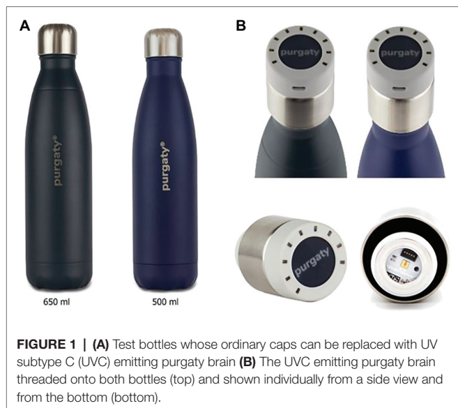
FIGURE 1 | (A) Test bottles whose ordinary caps can be replaced with UV subtype C (UVC) emitting purgaty brain (B) The UVC emitting purgaty brain threaded onto both bottles (top) and shown individually from a side view and from the bottom (bottom).

during a running disinfection cycle. This mechanism is designed to protect the user from contact with UVC radiation on skin or eyes. During the cycle, the LED and the sensor are periodically monitored to prevent malfunction. At the end of the 55 s cycle, the purgaty brain flashes to indicate the end of the treatment process. The cap has one Klaran UVC LED (part number KL265-50U-SM-WD) that emits radiation at 268.5 nm peak wavelength ( Figure 2B ) as confirmed using an Ocean Optics USB4000 photospectrometer.