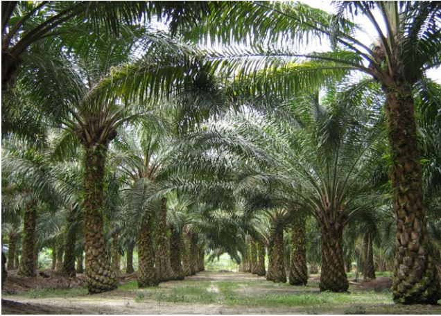
FIGURE 1 Oil palms within a plantation

the desired commodity. These processes release GHG. Nevertheless, only the effect on cultivation of OP is considered in this present review (Paterson, Kumar, Shabani, & Lima, 2017; Paterson, Kumar, Taylor, & Lima, 2015). Indonesia and Malaysia produce ca. 83% of palm oil contributing significantly to their economies. Malaysia's palm oil exports add 45% to the world's edible oil needs (Shanmuganathan, Narayanan, & Mohamed, 2014). The concentration of such a high proportion of palm cultivation in Malaysia/Indonesia is somewhat undesirable as cultivation in other countries combats threats from climate and locally adapted pests and pathogens. Further expansion into West Africa and Latin America creates a more secure production system in the longer term in the opinion of Murphy (2014) and a doubling of palm oil production in the next decades is considered feasible from this expansion. However, these estimations of production do not take into account CC (Paterson et al., 2015, 2017) which undermines these assessments, nor do they consider other negative consequences of OP development such as biodiversity loss (Fitzherbert et al., 2008) and most ecosystem functions (Dislich et al., 2017).