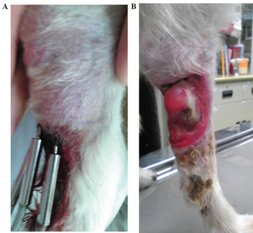
Figure 1 Gross appearance of case 1. (A) A rhabdomyosarcoma of the right forelimb. (B) On day 21, the tumor volume had decreased compared with the volume that was observed on day 0.