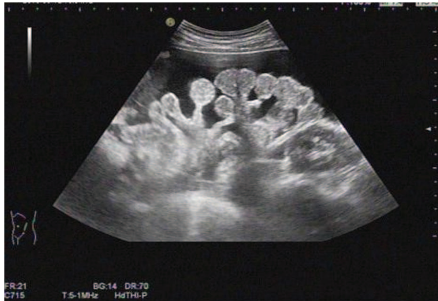
Figure 1. An abdominal ultrasound showing massive ascites.

paracentesis to improve symptoms nearly every month. After 1 year, a limited omentum-like echo in the left lower abdomen was found by peritoneal ultrasound. The ultrasound image showed a thickened uneven echo peritoneum of approximately 1.86 cm (Fig. 2). Then, a CNB of the thickened peritoneum was performed with a 14G needle under ultrasound guidance. The removed tissue was sent for pathological analysis. The pathologic diagnosis of endometriosis is based on the presence of 2 or more of the following features: endometrial glandular cells, surrounding stromal cells, and hemosiderin-laden macrophages. [3] In our patient, we observed endometrial glandular cells and surrounding stromal cells in the omental tissues (Fig. 3).