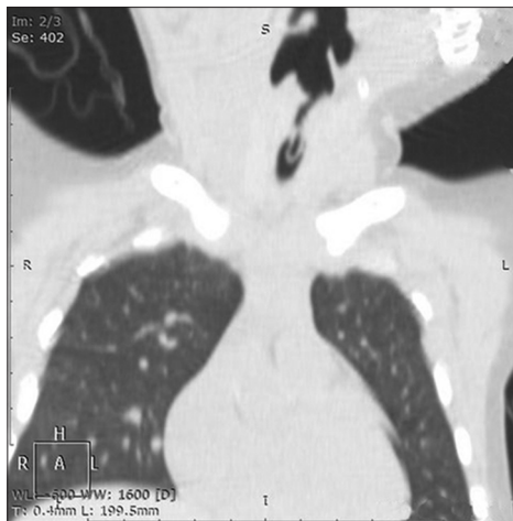
Figure 1: Coronal section of CT-thorax in lung window, demonstrating the impacted conical foreign body with a lumen oriented vertically in the center of the larynx starting from sub-glottic region below the vocal cords and extending into upper trachea. The foreign body is open at both ends

symptoms with rapid deterioration as compared to bronchial foreign bodies. [2] Asymptomatic bronchial foreign bodies are much more common. Few cases of asymptomatic tracheal inorganic foreign bodies have been reported. One was a case of a hollow metallic cylindrical foreign body in mid-trachea and other that of a plastic foreign body in trachea with a lumen. [2,6] Both these cases had foreign bodies with a lumen. The presence of a lumen within the foreign body permitting ventilation and the inert nature of the foreign body are factors responsible for relative lack of symptoms. The symptomatology of laryngeal foreign bodies depends on whether it produces complete or incomplete airway obstruction. In complete airway obstruction, the presentation is with catastrophic respiratory distress leading to apnea, cyanosis, loss of consciousness, and sudden death if foreign body is not dislodged. However, incomplete laryngeal obstruction may present with less severe symptoms and possible misdiagnosis or delay in diagnosis. [4] A history of choking and vocal changes is usually associated with laryngeal foreign bodies. [3] Other common presenting symptoms are stridor, wheezing, sternal retractions, and cough. They may be treated as croup or reactive airway disease poorly responding