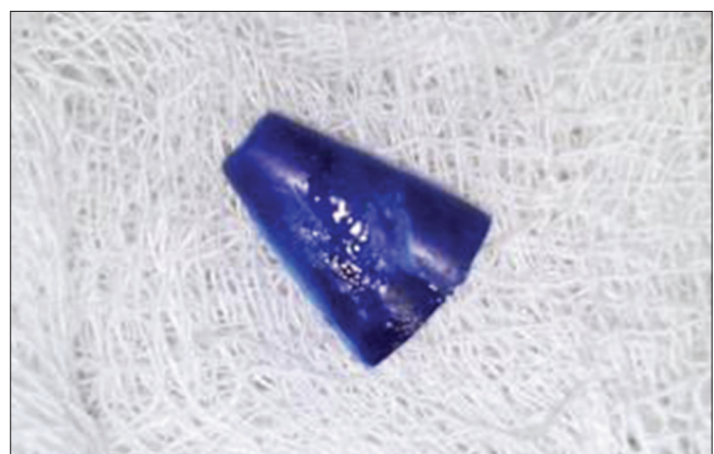
Figure 4: A 1.2 cm long hollow proximal plastic pen segment retrieved from larynx of the child by bronchoscopy