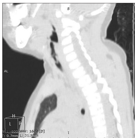
Figure 3: Sagittal reconstruction image of CT-thorax in lung window, demonstrating the conical foreign body with a lumen oriented vertically in the center of the larynx from sub-glottic region below the vocal cords and extending into upper trachea