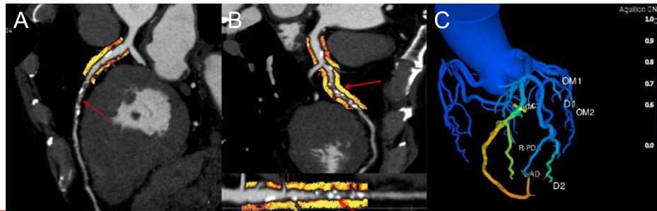
Figure 1. Schematic diagram of parameter capture. (A and B) Schematic diagram of PCAT capture for 2 acquisition lengths (40 mm and 70 mm). (C) Schematic diagram of capturing FFR CT with reconstructed coronary artery tree. PCAT, pericoronary adipose tissue; FFR CT fractional flow reserve with coronary artery CTA

distance of right coronary artery (RCA) ranged from 10 mm from the beginning to 50 mm and 80 mm, as shown in Figure 1. Fat attenuation index was defined as the CT mean of the interested segment (PCAT). The calculation of FFR CT was carried out through Shukun semiautomatic image post-processing workstations (CareSphere, TM, Perivascular Fat Analysis Tool, China). The calculation principle is to use the original CCTA images combined with the specific conditions of coronary artery lesions, calculate the fluid dynamic parameters in a reduced-dimension mode, and calculate the FFR CT value by overall simulation. The lesion-specific FFR CT value was measured at about 2 cm away from the distal end of the lesion. If there are multiple lesions, the FFR CT value of the distal lesion shall prevail. \Delta\text{FFR}_{\text{CT}} value = FFR CT value before each lesion stenosis – FFR CT value after each lesion stenosis, as shown in Figure 1.