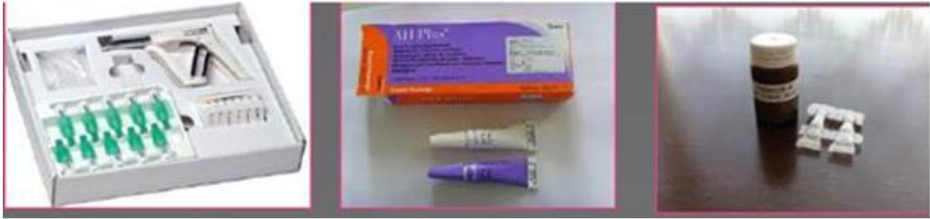
Figure 2. The tested sealers.

shaped root canals. One Shape instruments showed significantly better fracture resistance compared to ProTaper instruments in the present study. This could be attributed to the fact that One Shape files permit more round cross-sectional root canals during preparation because of their “S” cross-section with two cutting angles. During the root canal preparation, a relatively low concentration of NaOCl (2.5%) was used as an irrigant to minimize any adverse effects on the dentin mechanical properties. 20