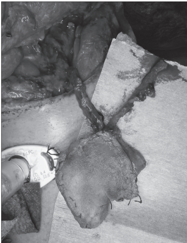
Fig. 1. Radial forearm free flap well perfused.