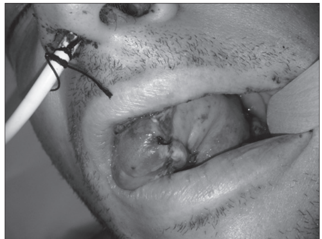
Fig. 4. Venous stasis of the radial forearm free flap.