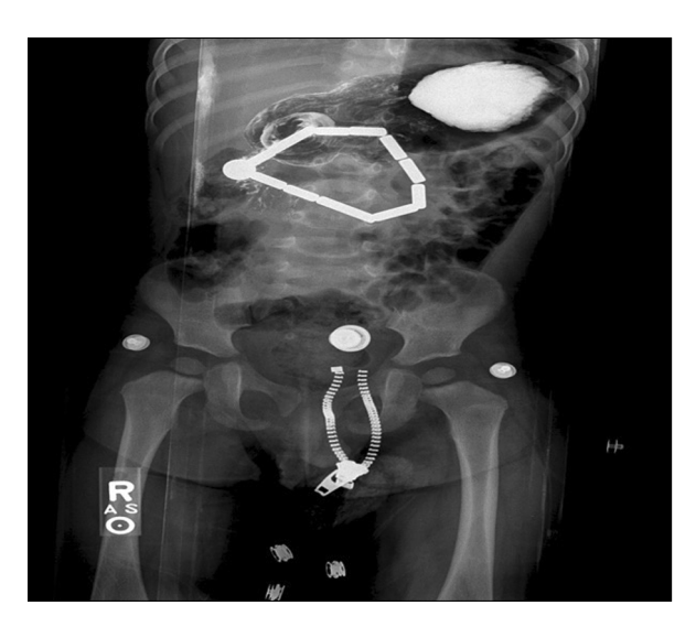
Fig. 1. Upper gastrointestinal series shows a series of foreign bodies attached end-to-end and looping from the stomach through the duodenum.

A 19-month-old male in his usual state of good heath presented with a three-month history of progressive non-bloody, non-bilious emesis. The mother denied history of fever, diarrhea, or abdominal pain. His growth parameters plotted above the 75th percentile for height and weight, and there was no previous history of gastroesophageal reflux symptoms. He was referred to our institution where an upper GI series (UGI) showed 13 ingested foreign bodies connected end-to-end and looped from the stomach through the pylorus into the duodenum (Fig. 1). His mother reported that he had received a box of plastic colored magnets as a gift several months earlier.